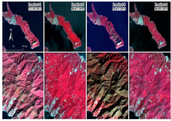
Figure 3: Satellite images for Mt. Athos, (Mallinis et al, 2016).

map for fire exposure and risk. The figure below illustrates the satellite images that utilized within the study, where these images were utilized to extract the cover of the fuel within Mt. Athos.