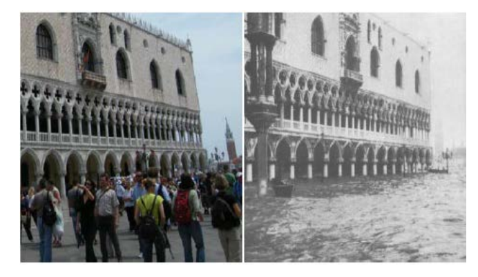
Figure 1: the flood in Venice city (Foley et al, 2008).

Another WHS is Timbuktu, which is situated in the north of Mali near to the desert of Sahara. Timbuktu has been siting as a WHS in 1988 by UNESCO.Further, Timbuktu involved three main mosques: