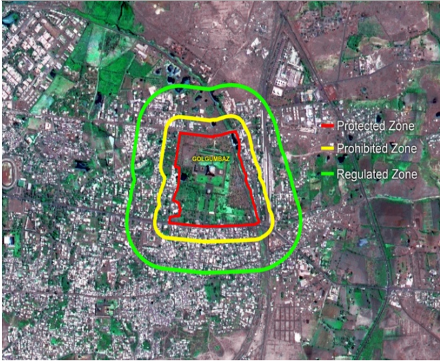
Figure 5: the zones delineated by GIS (ISRO, 2016).

The technology of GIS has been also utilized within the project established by the "Indian Space Research Organization (ISRO)" and the "Ministry of Cultural (MOC)". The goal of this project is to monitor and identify the heritage sites within India. Also, the project helps to manage and preserve a great number of monuments and heritage sites within the country. GIS has been utilized to generate a map for the significant heritage sites within India, where three zones of management have been identified around the target sites using GIS. The figure below illustrates the zones delineated by GIS (ISRO, 2016).