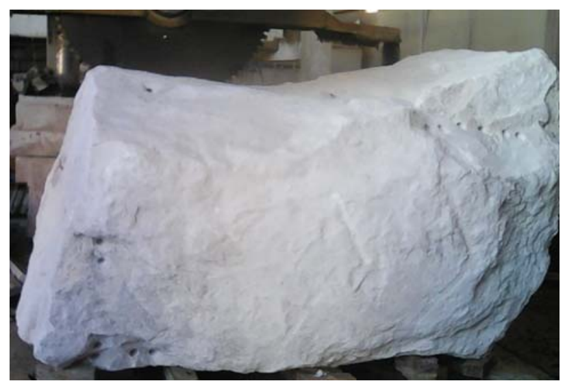
Fig. 3 Block measurement.

Measurements were made on the dimensions of the marble block (Figure 3), the dimensions of the finished product and on objects that have a direct relationship in the tile manufacturing process, especially the cutting discs that are the ones that make the slab thinning.