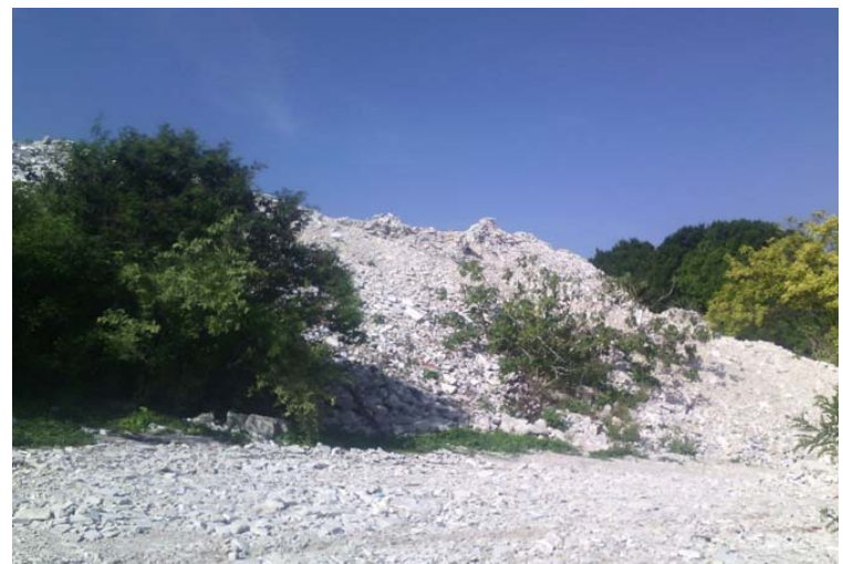
Fig. 1 The ecological damage of the marble waste.

Most people work with minimum wages, few health and safety conditions (Garces et al., 2005). Annually in the area of Tepexi de Rodríguez is generated approximately 145,560 m^3 of waste (Cortes, 2015). These residues put them outdoors causing erosion and infertility in fields (Figure 1) and through decades of exploitation, these dumps have affected the visual environment of the municipality.