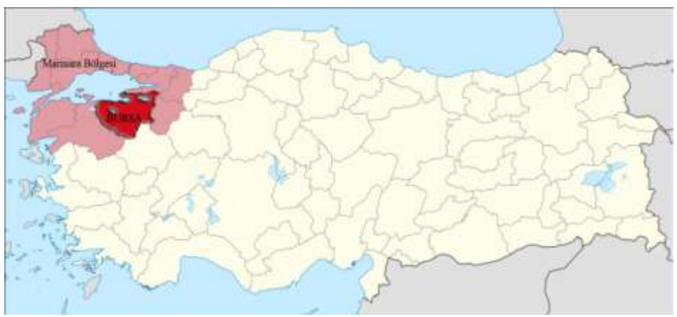
Figure 3. Bursa in Turkey and Marmara Region