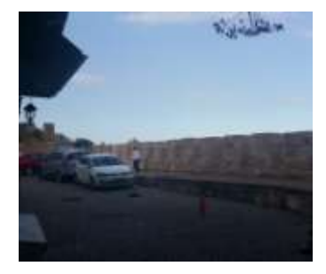
Figure 8. Some views from case study area

The study area does not include adequate social / public spaces in the context of urban space diversity. Diversity must be provided to meet the needs of different individuals. These urban spaces should create routes where different experiences could be experienced in harmony despite their diversity.