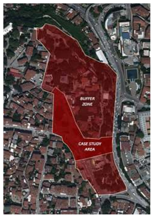
Figure 5. Boundaries of Case Study Area (adapted from Google Earth)