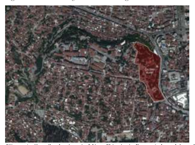
Figure 4. Case Study Area in Hisar District in Bursa (adapted from Google Earth)

Due to its historical and cultural heritage values, the area between Hisar and the Historic Covered Bazaar and Hans District was designated as the study area (Figure 5). Urban public spaces between these two districts, which are of great significance for Bursa historical city center, were examined from the perspective of the urban design discipline and important features of urban spaces with their existing historical and cultural values and the potential of and problems in these areas were identified. The present study aims to contribute to the construction of healthy and quality spaces that would sustain the urban cultural heritage that contributes to the life of the urbanite, which should be enriched with new participations, meanings and developments.