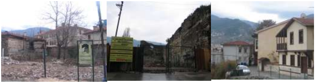
Figure 7. Some views from case study area

Unqualified and neglected buildings, inadequate indoor and outdoor public spaces around the study area are insufficient to meet the needs of the inhabitants, workers, tourists and transit passengers. This district is not used effectively due to insecure areas and this insecurity poses a threat to the items of historical and cultural heritage (Figure 7). The security of the area should be provided and activities related to the historical and cultural characteristics of the area should be organized. Thus, urban spaces that provide opportunities for people and urbanites to develop their own local economy, environment and social values would be created.