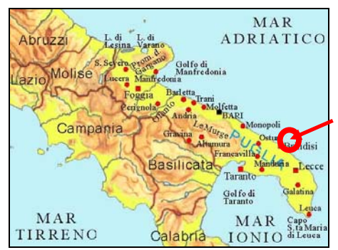
Fig. 2. Case study area

The two farms under study, the organic farm "Serenerba" and conventional "!II Frantoio", are chosen in Ostuni municipality, an area characterised by olives. Ostuni municipality is located in the Adriatic coastal part of the southern Italy. It has a Mediterranean climate characterised by 678 mm of annual rainfall and 6.63 °C and 11.97 °C the respective average annual minimal and maximal temperatures (ACLA 2, 2001). It is a locality where olive growing is a traditional activity and sometimes the very well developed tourism is combined with the agro tourism.